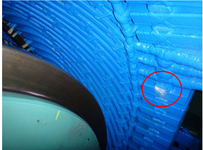
Figure 1 – Dusting Between Felt Block and Stator End Cap